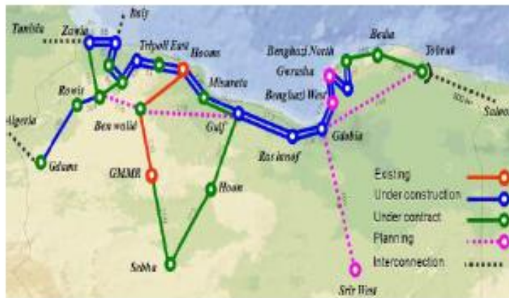
Figure 2: the Libyan transmission network

The power plants in different areas and the centers of the loads are connected by each other by means of transmission lines networks system at different levels of voltage. Based on the fact of big area and distributing populations in different and far area, the transmission faced and is facing many problems related to the operating and maintenance issues. The wide area and fragmenting loads force Libyan government to provide yearly continues investment to deal with the load growth and to save the continues flow of the power for all the customers. Therefore For covering the load-growth which is estimated around 7-13% , the transmission network with all main electric power plants remains the most important part of the Libyan power sector. The transmission power system of Libya can be divided in to three interconnected regions. Figure 2, shows the high voltage transmission lines.