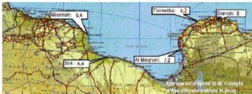
Figure 4: the suitable wind farm and its wind speed

The wind map of Libya indicates that wind speeds of between 6 : 7,5 m/s which is sufficiently high to run high power units. based on these speeds There are several suitable sites along the coast, such as Dernah, Almagron, Msalata,...etc. figure 4, illustrates the suitable sites for wind farm and its wind speed.