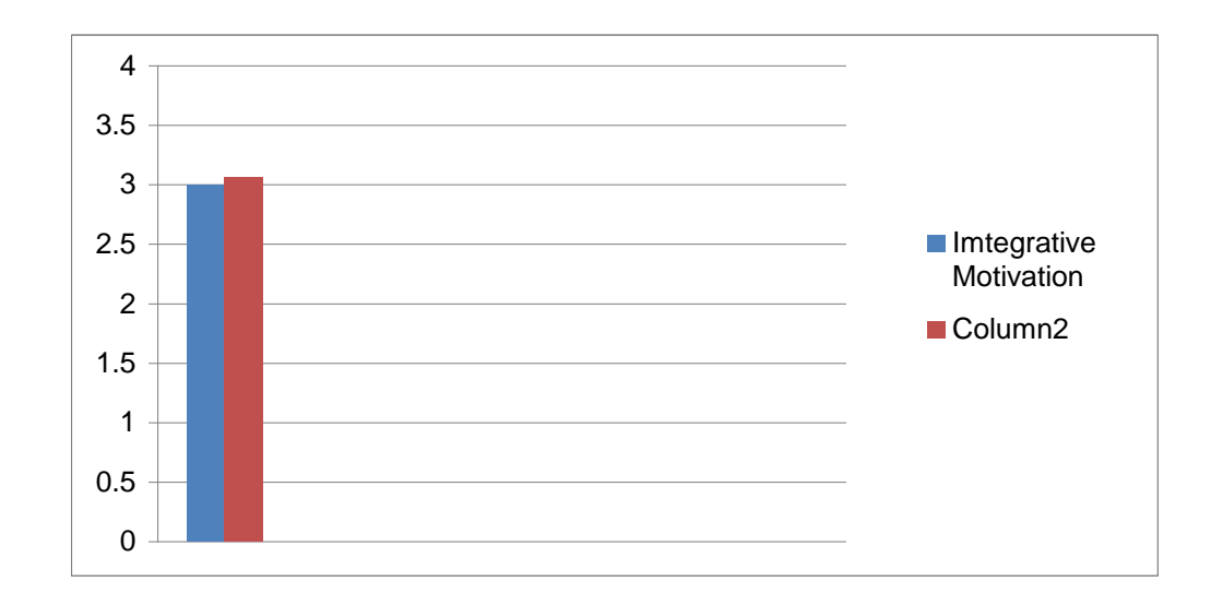
Figure(3): Distribution of means of integrative and instrumental motivation

Figure (3) below illustrated that there is no big difference between the two scores; they appear to be close to each other.